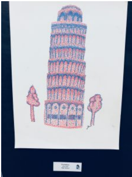
Pointillism Leaning Tower of Pisa High School