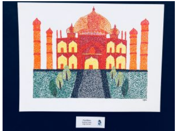
Pointillism Taj Mahal High School