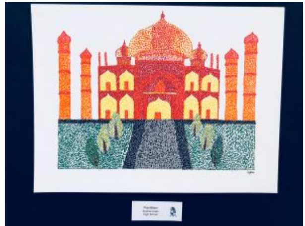
Pointillism Taj Mahal High School